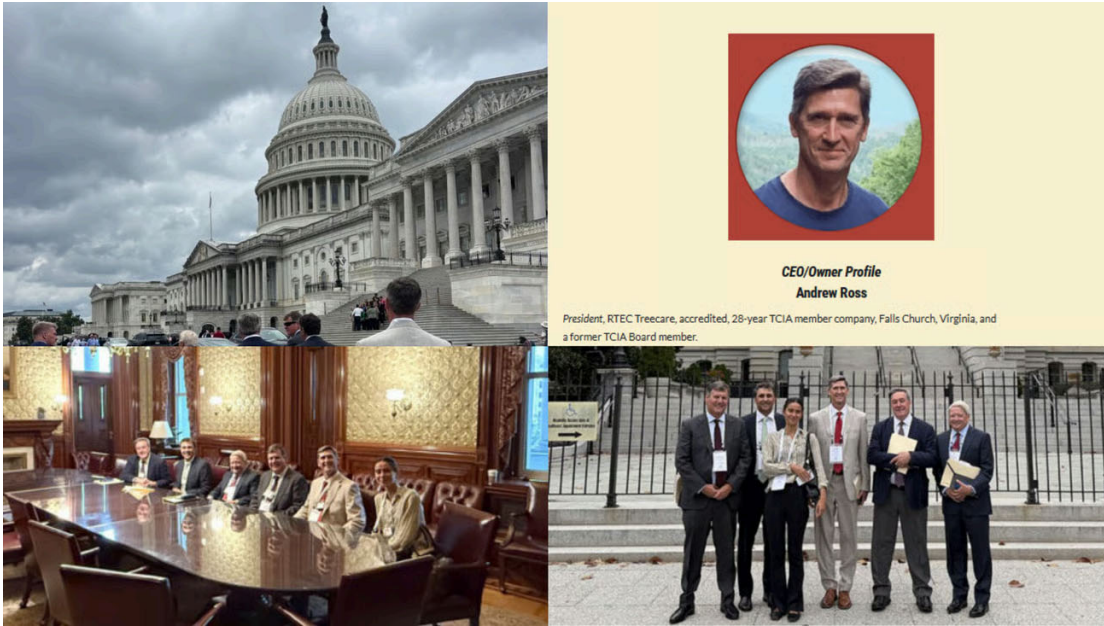
President, RTEC Treecare, accredited, 28-year TCIA member company, Falls Church, Virginia, and a former TCIA Board member.

This spring, we partnered with the Virginia Department of Forestry to connect homeowners to a federally funded Emerald Ash Borer treatment program. Eligible participants received financial reimbursements for treating their ash trees. We proactively reached out to everyone in our system identified as having a standing ash tree to ensure they could take advantage of this opportunity.